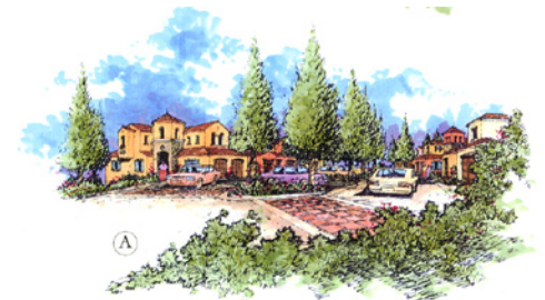
Piazza Homes Concept