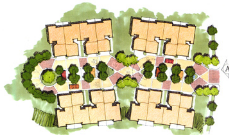
Auto Court Townhouse Cluster