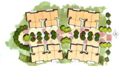
Auto Court Townhouse Cluster